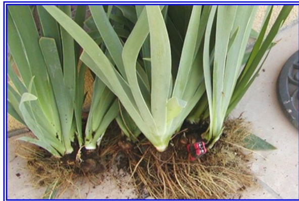
Next, using a clean, sharp knife, I separate the growing rhizomes from the spent rhizome.