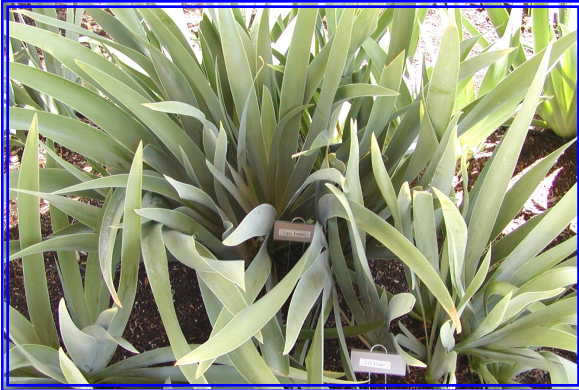
Above is an overcrowded clump of irises that obviously needs dividing.