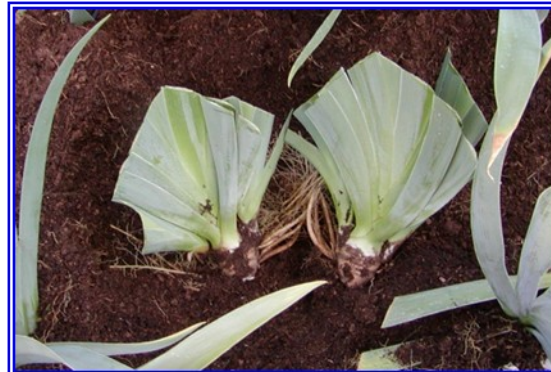
Last, I replant 2 of the divided rhizomes and put the remainder in a cool dry place until sale. I replant Two because they fill out faster.