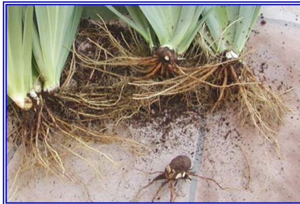
This picture shows the growing rhizomes and the spent rhizome, the plant that bloomed this spring