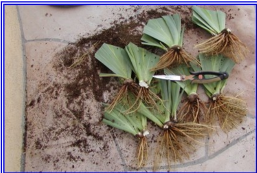
This shows all the rhizomes trimmed. I use grass trimmers because they are a little longer than shears.