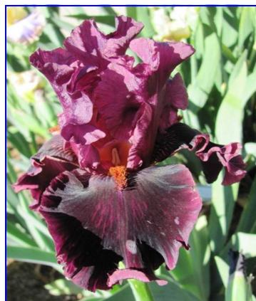
AUNTIE CLAUDIA Burseen 2010