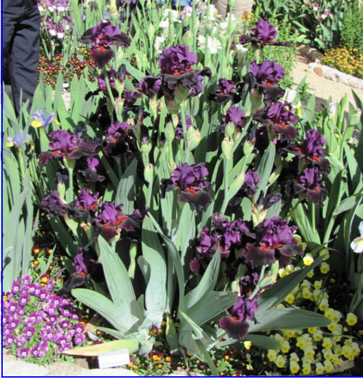
Black Magic Woman