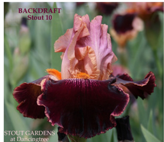
BACKDRAFT Stout 10 STOUT GARDENS at Dancingtree