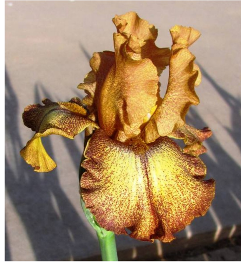
Camera Ready Tasco 2009