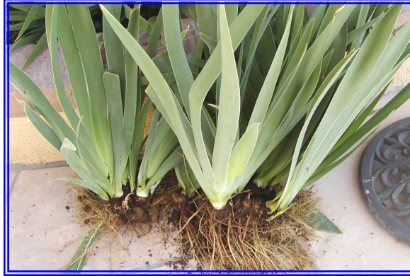
First, I dig out the clump and remove as much of the dirt as I can, without causing too much damage. (Notice the umbrella stand.)